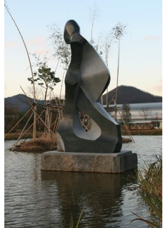
Plate 8. ' Surprise move ' (2009) Dimensions 400 cm x 200 cm 180 cm Material - Black Korean granite Location - Boryeong, South Korea

The sculpture depicts an abstract human form in a kneeling gestural pose with uplifted hands in