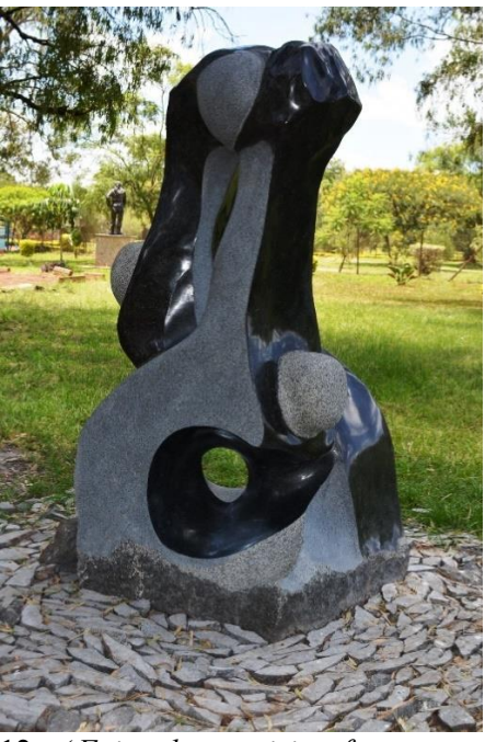
Plate 12a ' Fair play: spirit of sportsmanship ' (2014) Dimensions - 240 cm x 110 cm x 100 cm Material- Granite Location – Nairobi, Kenya

Article DOI: https://doi.org/10.37284/ijar.3.1.329