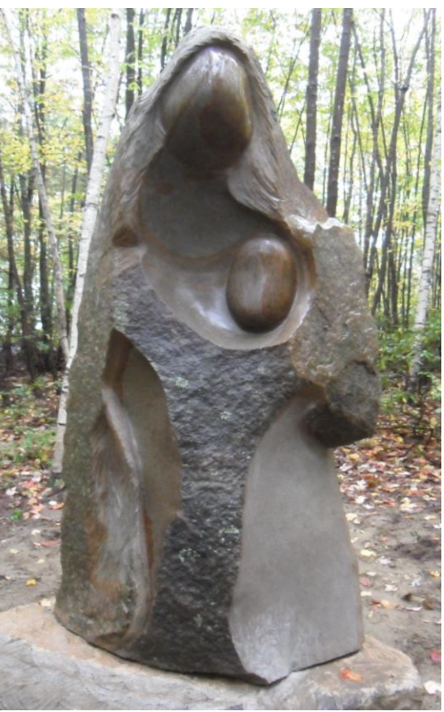
Plate 4 'Souls of peace' (2010) Dimensions – 240 cm x 140 cm x 130 cm Material - Granite Location - Brookline NH - USA

Plate 4: "When indeed one is peaceful then the people around him or her will have peace. We