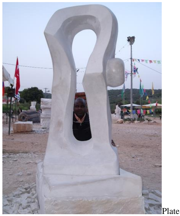
16b "Down to earth' (2009) Dimensions - 240 cm x 110 cm x 100 cm Material – Marble Location – Maalot Tarshia, Israel

defined by the direction of light and shadows falling upon the sculpture.