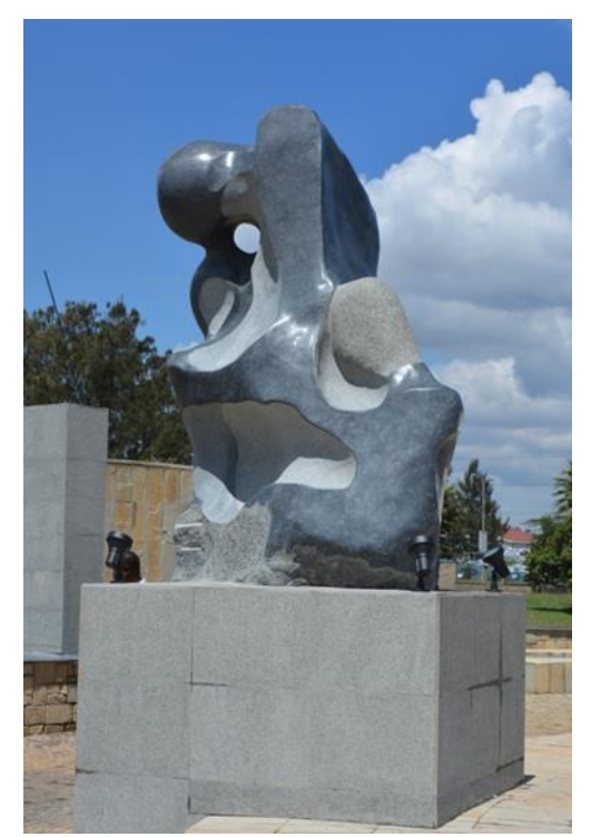
Plate 1a ' Love for the Nation ' (2013) Dimensions 210 cm x 200 cm 480 cm Material – Ndalani Black granite Location – Uhuru Gardens – Nairobi, Kenya

In the 'Love for the Nation' (Plate 1a & 1b), the artist uses the sculpture in an analogical manner, suggesting that the love of a mother for her children and her sacrifice therein is akin to the love and sacrifice for the Nation. At times, sculptures bear this kind of intertwined or tethered meaning where the intended meaning is not necessarily found in the physical rendition of the sculpture itself but is suggested in 'retrospective thought' where the meaning is redirected towards its original intent. The sculpture shows the mother fondly embracing and caring for her two children, one at the front and another at the back. It thus suggests that people, just like heroes and freedom fighters as well as the heroism displayed in the virtue of the mother's sacrifice, should love and sacrifice for their country