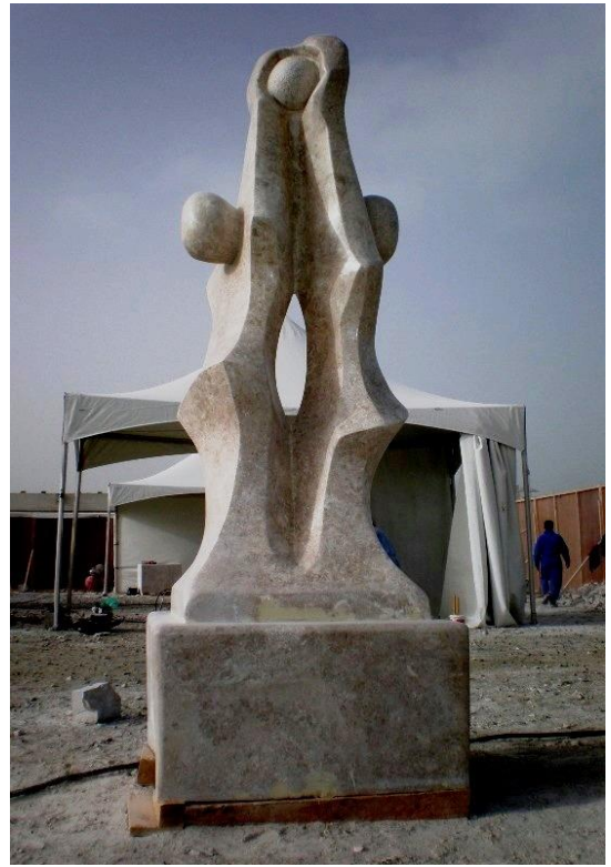
Plate 15 ' Target ' (2008) Dimensions - 210 cm x 80 cm x 60 cm Material - Oman Marble Location - Dubai

determination of everyone to mitigate against failure in whatever endeavour in life. Such sculptures, therefore, may be effective only at 'face value interpretation' but may require a more thoughtful audience to determine that the 'on your marks' gestural pose is not really that of the unnamed athlete but refers, in retrospect, to the 'on your marks of life' that also denotes the essence of time and urgency since life itself is like a race.