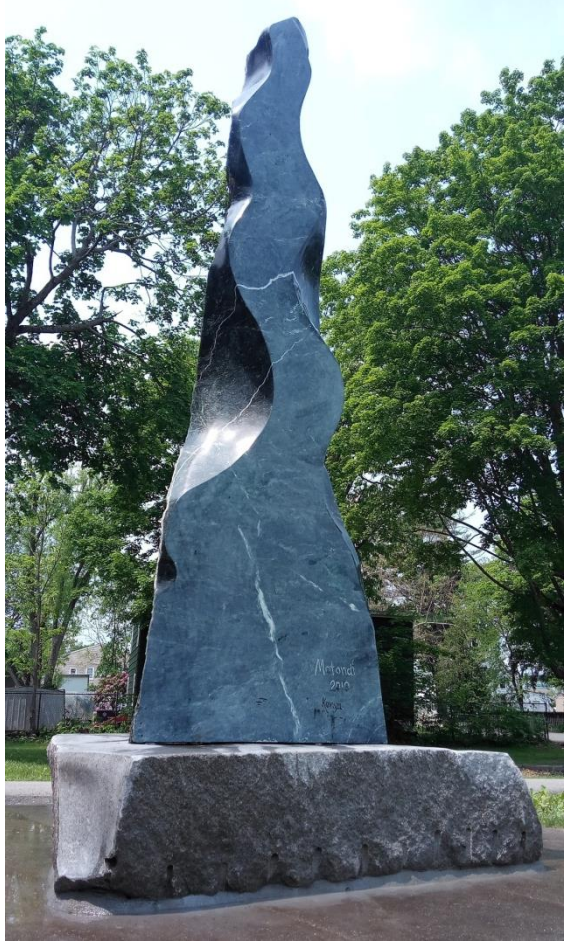
Plate 6 'Germination of spirit' (2019) Dimensions – 50 cm x 130 cm x 150 cm Material - Green Serpentine Location - Nashua City, NH- USA

'human embrace' is in itself already suggestive of the spirit of mutual goodwill among human beings. This means that the sculptor intended the two depicted forms to represent this concept and, by their gesture, further suggest or infer the permeation of peace from one endowed entity (who possesses it) to another (who desires it). In this context, the sculpture is effective but could also be open to other interpretations and has often been interpreted, in some instances, to bear the 'Madonna and child' symbolism.