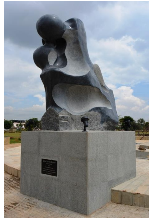
Plate 1b 'Love for the Nation' (2013) Dimensions – 210 cm x 200 cm 480 cm Material - Ndalani Black granite Location - Uhuru Gardens –Nairobi, Kenya

In the 'Love for the Nation' (Plate 1a & 1b), the artist uses the sculpture in an analogical manner, suggesting that the love of a mother for her children and her sacrifice therein is akin to the love and sacrifice for the Nation. At times, sculptures bear this kind of intertwined or tethered meaning where the intended meaning is not necessarily found in the physical rendition of the sculpture itself but is suggested in 'retrospective thought' where the meaning is redirected towards its original intent. The sculpture shows the mother fondly embracing and caring for her two children, one at the front and another at the back. It thus suggests that people, just like heroes and freedom fighters as well as the heroism displayed in the virtue of the mother's sacrifice, should love and sacrifice for their country