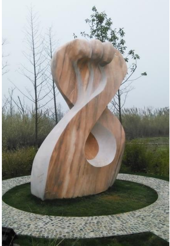
Plate 9 ' Freedom of thought ' (2014) Dimensions – 300 cm x 200 cm x 100 cm Material - Pink marble Location – Changsha, Hunan, China

celebration of achievement; it denotes triumphant power from within. The artist achieves this by using solids and voids as well as creating planes and sharp edges by neatly slicing out marked-out parts of the stone. These planes contrast with the black smooth textured surface of the granite. The form also shows the creation of the head and the shoulders that stretch out into an elongated arm that curves back towards the head.