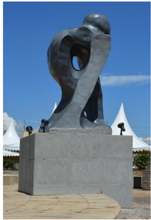
Plate 2a ' Heroes Move ' (2013) Dimensions 210 cm x 200 cm 480 cm Material – Ndalani Black granite Location – Uhuru Gardens –Nairobi, Kenya

Article DOI: https://doi.org/10.37284/ijar.3.1.329