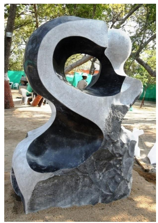
Plate 7a 'Manifestation of achievement' (2011) Dimensions 190 cm x 90 cm 60 cm Material - Black granite Location - Baroda, India

"The theme for the workshop that led to the creation of this piece was "Evolve", which was decided by the client. My thought was, hence,