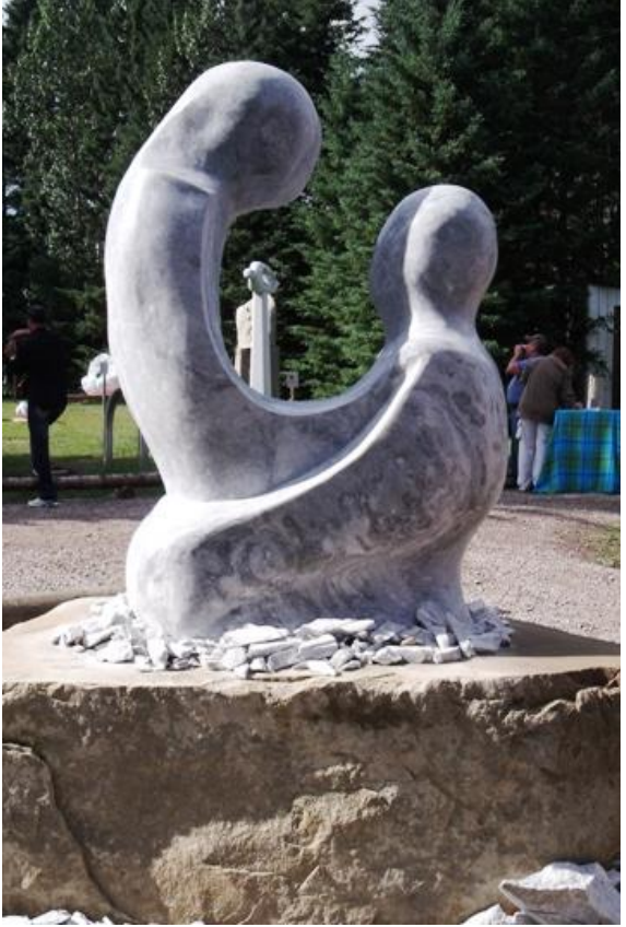
Plate 11 ' Desire to be ' (2009) Dimensions – 220 cm x 200 cm x 180 cm Material - Marble and Sandstone Location – Alberta, Canada

inter-activeness and dialogue or mutual interlock, even though they come from different backgrounds. The artist uses the concept of solids and voids and uses contrasting sharp-edged planes; he also exploits the natural colour and texture of the pink marble stone. It is meant to be a sculpture of peace and coexistence as well as mutual respect. Such abstract sculptures are, however, difficult to decipher without prior explanatory cues since covert messages, in this case, 'freedom of thought and mutual respect that ostensibly exist among diverse peoples, cannot be expressed or manifested in the physical sculpture. The sculpture itself, therefore, may also be subject to multiple interpretations. It is, hence, unclear whether the artist's noble thought is ultimately captured in the essence of this sculpture or whether, instead, the sculpture bears other interpretations. It has, for instance, been interpreted as a clenched fist, denoting power, which is more symbolic of defiance than the spirit of peaceful coexistence.