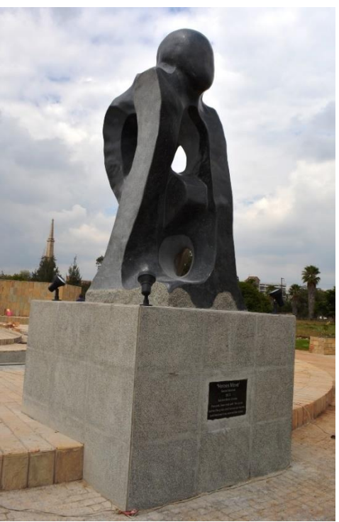
Plate 2b ' Heroes Move ' (2013) Dimensions – 210 cm x 200 cm 480 cm Material - Ndalani Black granite Location - Uhuru Gardens –Nairobi, Kenya

In ' Heroes Move' ( Plate 2a & 2b ), the artist depicts what he perceives to be the posture of a hero, with the head held high, long hands holding down and the body crouching. The entire body posture denotes stability and strong anchorage. The gist of the message is that in order for one to succeed in any endeavour, he or she must be well anchored in