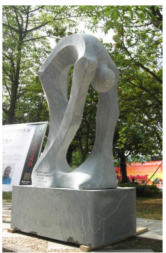
Plate 13b ' On the marks ' (2007) Dimensions – 240 cm x 100 cm x 70 cm Material - Marble Location - Guangdong, China

In 'On the marks' (Plate 13a & 13b), the artist depicts a human form on the 'on your marks' pose, underscoring the content of the title. Heavily stylised, the sculpture denotes a person at the 'starting point' of life. Just like an athlete, the head faces down, with the upper body or spine propped up, with hands and shoulders held down, ready to take off. The sculpture is not rounded but bears lines that specify the various sculptural edges and narrow planes. These edges are important in defining the sculptural body mass and help to determine the falling of light and shadows upon the sculpture,