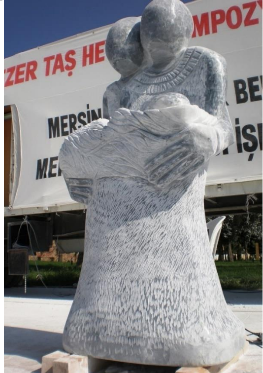
Plate 14 ' New life ' (2008) Dimensions – 200 cm x 90 cm x 80 cm Material – Marble Location - Mersin metro-City –Turkey

physical message, that is, the depiction of a human form about to take off from its 'starting point'. It does not, however, carry the interpretative analogical 'value' as envisioned by the artist since, by its nature, it bears no such impetus; it cannot communicate to the audience that the real underlying meaning is, indeed, the 'starting point of any useful endeavour in life. It cannot reiterate that the focus is not just confined to the focus of an amorphous athlete, but it is the focus and