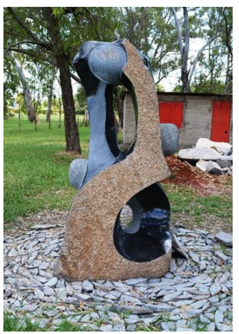
Plate 12b ' Fair play: spirit of sportsmanship ' (2014) Material – Granite Location – Nairobi, Kenya

In ' Fair play: spirit of sportsmanship ' ( Plate 12a & 12b ), the sculpture depicts two figures in competition, tussling for the high ball. The sculptor uses interlocking stylised forms to bring out his message. In plate 12a, one figure leans forward with hands stretched backwards in an almost awkward reach for the ball. In plate 12b, the artist uses the texture of the stone to define a form, also reaching