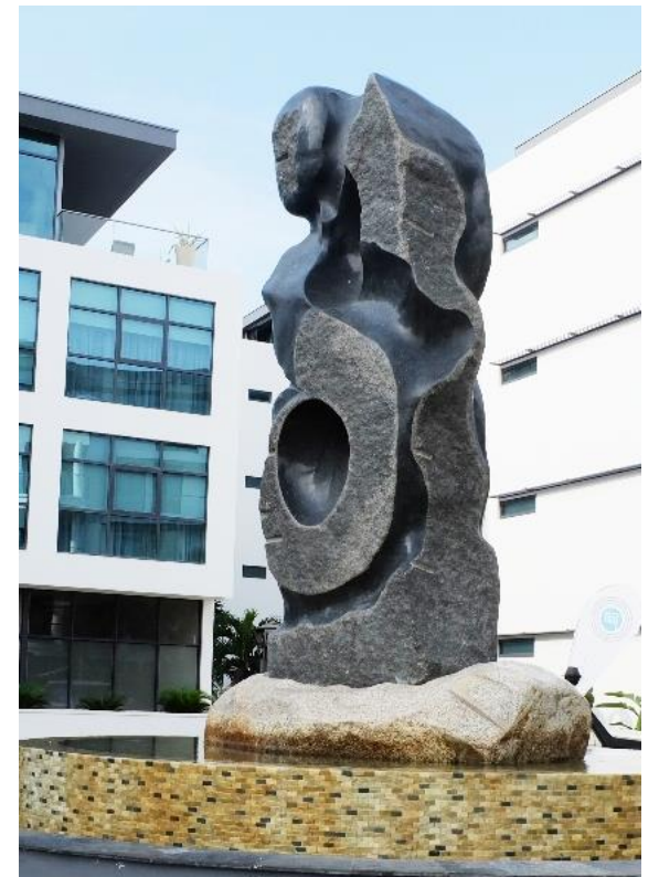
Plate 3 'Interlude' (2012) Dimensions – 510 cm x 300 cm x 300 cm Material – Black granite Location – Mombasa, Kenya

Article DOI: https://doi.org/10.37284/ijar.3.1.329