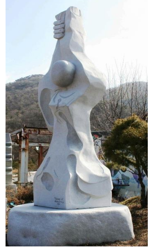
Plate 5 'Owning up' (2016) Dimensions 700 cm x 150 cm x 130 cm Material - Grey granite Location - Boryeong, South Kore

Sculptures are, of course, not able to depict subtle phenomena like peace or tranquillity because they are not visible; they are preserved within the human spirit; you cannot view a sculpture and determine that peace is being permeated from one entity to another. But through the nature of composition and the use of certain gestural poses, sculptures can 'suggest' the occurrence of such phenomena. For example, in this sculpture, 'Souls of peace', the