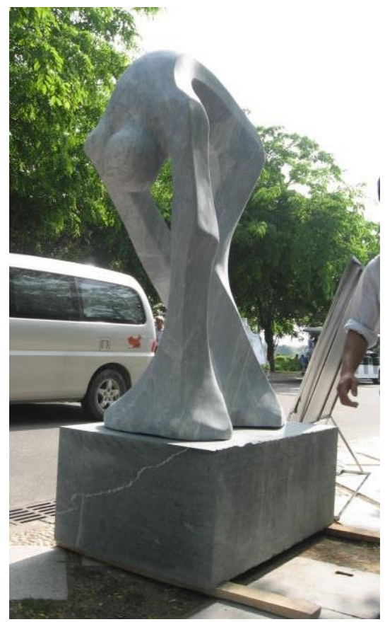
Plate 13a ' On the marks ' (2007) Dimensions – 240 cm x 100 cm x 70 cm Material – Marble Location - Guangdong, China

Article DOI: https://doi.org/10.37284/ijar.3.1.329