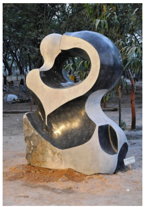
Plate 7b 'Manifestation of achievement' (2011) Dimensions – 190 cm x 90 cm x 60 cm Material – Black granite Location – Baroda, India

In ' Germination ' (Plate 6), the artists allude to the notion of the inner human drive or spirit which germinates into growth and eventual achievement. The concept of germination is heavy at the foundation that supports all subsequent growth and blossoming. The green serpentine stone is symbolic of green vegetation, which in turn symbolises growth and nourishment.