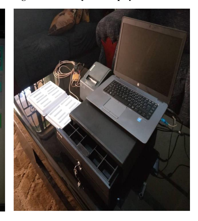
Figure 3: Whole System Display