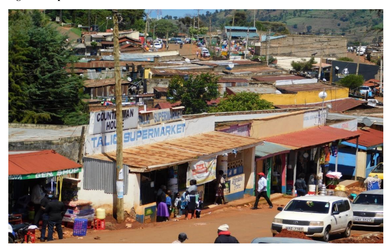
Figure 4: Kapsowar town

and promotes the growth of the town. Hospital workers and traders are assured of security.