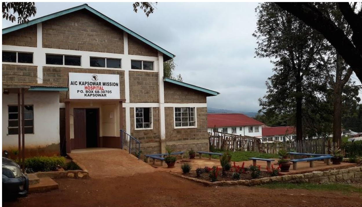
Figure 3: AIC Kapsowar Mission Hospital

When the new regime took office, there was a lot of fear that the hospital would never receive resources as it used to when the benefactor was in power. The fact that Moi was not in power never stopped him from supporting the hospital. His generous support continued as was before. The next hope was being built on the new constitution which began to take shape when the new government took office. The new constitution which was promulgated in 2010 advocated for the devolved system of government. This meant that governments would be brought to the grassroots level. This move made the Hospital management have hope that the County government would also cheap in to inject more resources just like what Moi used to do while in power (Oral Interview, 55 years Old, 13, August 2021).