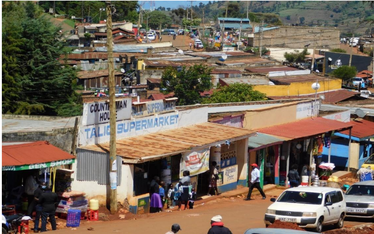
Figure 4: Kapsowar town

and promotes the growth of the town. Hospital workers and traders are assured of security.