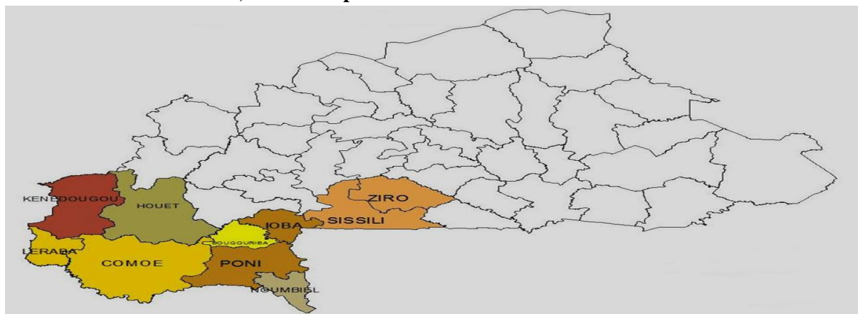
Figure 1: The different provinces in the 04 administrative regions (cascades, hauts-basins, southwest and centre-west) of cashew production in Burkina Faso

The region of the southwest (composed of Poni, Ioba and Bougouriba provinces) located between 10°67' and 12°11'N and 2°84' and 5°49' W is the third region of cashew production with 884 producers (UNPA, 2014). In the southwest region, the average annual temperature is between 21°C and 32°C; the average annual rainfall is between 900 and 1200 mm. The soils are tropical eutrophic brown on clay material, moderately ferralitic on sandy-clay material and hydromorphic mineral (Belem, 2017). The centre-west region (composed of Ziro and Sissili provinces), located at 11° 45' N and 2° 15' W, is the fourth region of cashew production with 783 producers (UNPA, 2014). In the centre-west region, the average annual rainfall is between 600 mm and 900 mm; the average annual temperature is 37 °C, and the soil is tropical ferruginous, tropical eutrophic brown with low leaching and hydromorphic with low humus content (Asimi, 2009).