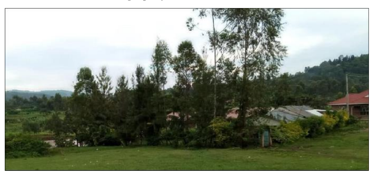
Plate 1: Human Settlements along Kipranye River Source

competition among locals and other investors who may want to use such lands for construction purposes. The same is reiterated by Nguyen eta l. (2017), who explains that population increase and human settlement have led to exploitation and destruction of the natural resources found in the wetlands, such as thatching grass and sedge that is used for making handbags, mats, hats and baskets to sell as their source of income to support their families.