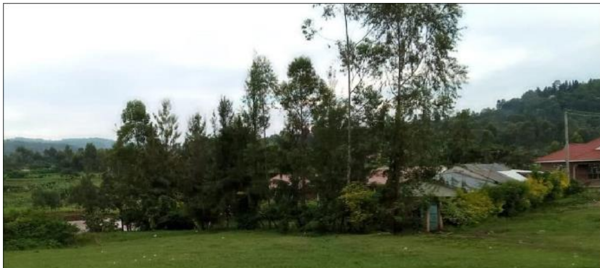
Plate 1: Human Settlements along Kipranje River Source

competition among locals and other investors who may want to use such lands for construction purposes. The same is reiterated by Nguyen et al. (2017), who explains that population increase and human settlement have led to exploitation and destruction of the natural resources found in the wetlands, such as thatching grass and sedge that is used for making handbags, mats, hats and baskets to sell as their source of income to support their families.