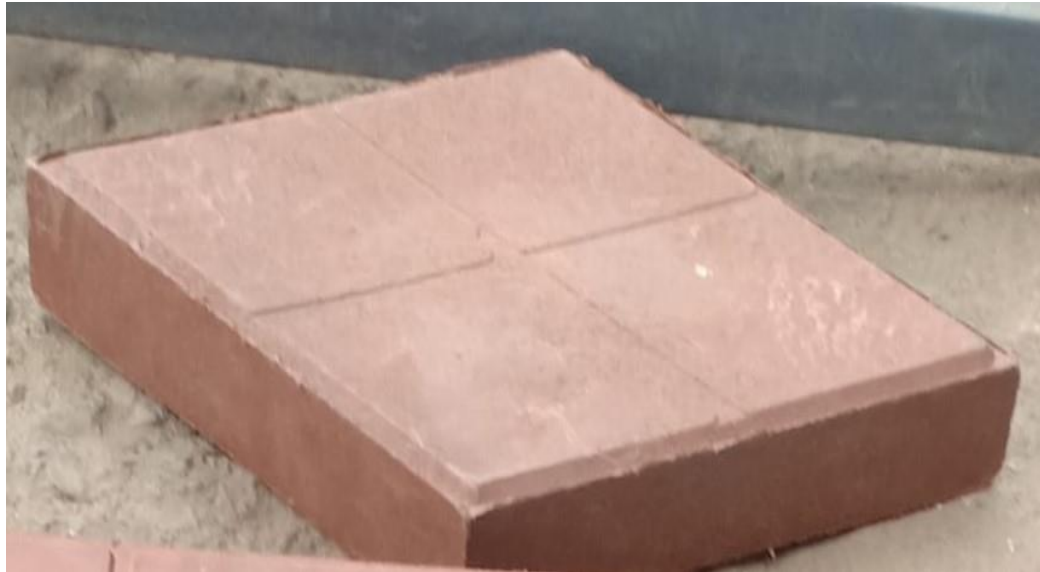
Plate 1: Plastic paving Block