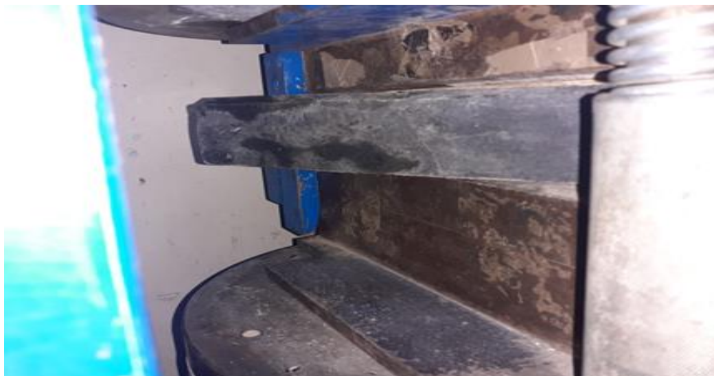
Plate 2: The prepared samples are placed in the strength testing machine

The area of failure, S (mm 2 ) was then obtained by multiplying the mean of the two measurements of