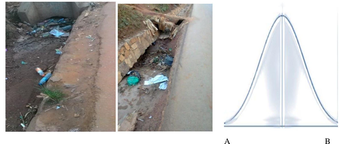
Figure 1: Dumping on Highways as a Normal Distribution curve for a Given Commercial Area.

This is normally done by all vehicles and individuals spotted dumping irresponsibly. It was noted that the experiment was done within six days selected randomly and respectively for the selected highway roads. It was noted that dumping had a normal curve as observed in Figure 1, maximizing at town or areas with refreshments for the road travellers along the roads.