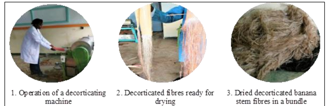
Figure 1: The process of decortication and drying of BS fibres

The fibres from the banana stems were extracted using a decorticating machine. 50 stems were decorticated. The decorticated BS fibres were washed and sun-dried. Figure 1 shows the decorticating process.