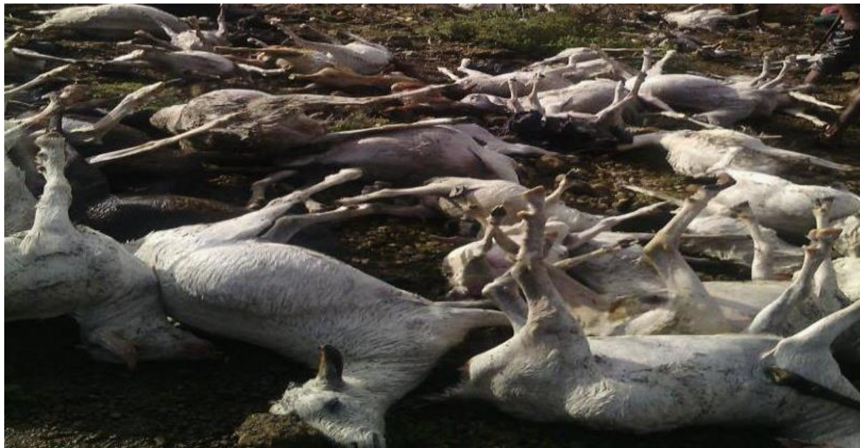
Plate 1: Dead livestock caused by floods in the lowlands of the Arusha region

During heavy rains, floodwater from the highlands of Mt. Meru has destroyed the household items; domestic animals have been swept away. Yesterday, the flood swept away our goats and sheep. Come and see and take a photograph (See Plate 1). It is a real pain for the death of the livestock as it is the source of income. People are planning to migrate to the highlands once enough money to purchase pieces of land is obtained. Living in the lowland is just putting our lives at high risk because our livestock and properties can be swept any time when floods and wind increase (Anonymously, December 2020).