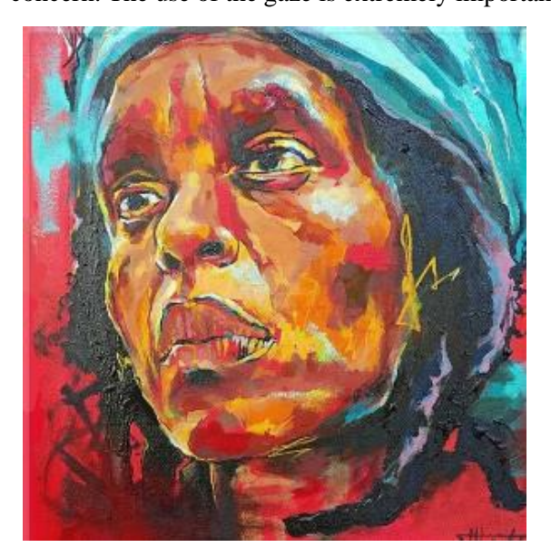
Plate 13. 'Thou shall not fear.'

in creating the character in a portrait. It can be concentrated solely on the eye-level or can be portrayed holistically, enhanced by other aspects of the face such as facial muscular tension, the angled twist of the face or the treatment of the lips, as is often the case. Tight lips, for instance, can imply tension and anxiety; lips that are slightly ajar can imply consternation or resignation; muscular tension can pull the face towards a certain direction, giving it a definitive expression that draws meaning. The artist also uses the effect of illuminative light on the face. The most memorable part of this portrait remains the facial scarification which underscores its cultural significance that is often the objective of some portraiture.