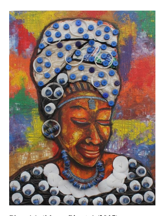
Plate 16. 'Mama Plastic' (2017)

Plate 15 is an impressionist inspired portrait of a woman executed with bold brush strokes and spontaneous colour application. However, the colours are not bright but seem subdued. The artist uses colour tones and patches of falling light to show the main features of the face. The eyes stare