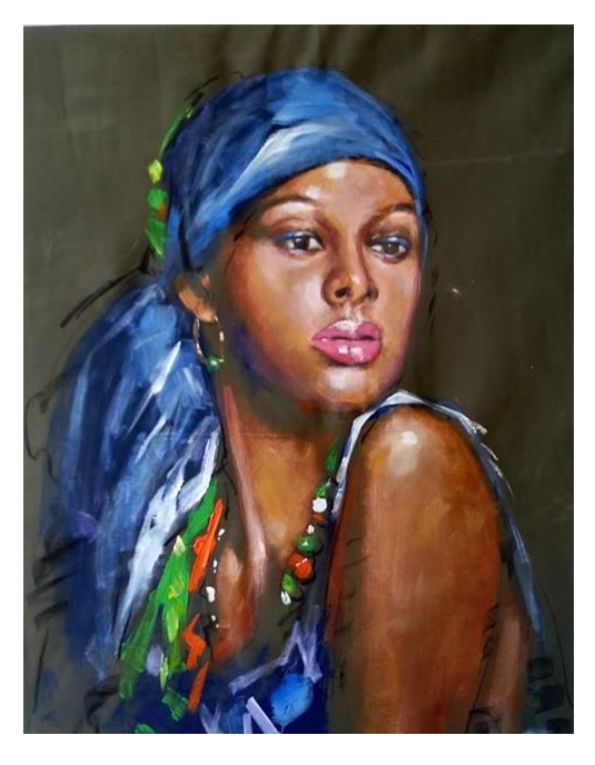
Plate 17 'Debonair'

the artist. The face itself is painted with evident brush strokes and colours that show shiny spots of light that define facial structure. The artist uses only the detail necessary to bring out the radiant expression depicted by the broad smile. Such portraits are used to draw the viewers' attention in order to highlight specific issues of interest, in this case, the use of recycled items to create art. It is unlikely, therefore, that the artist was interested in studying the personality of the subject as such; the angle of view makes the eyes appear closed and the face itself looks down suggesting that a character study was not a pre-eminent consideration. The basic posal expression on the almost sculptural face, however, is of a female face that suggests contentment with her unusual adornment.