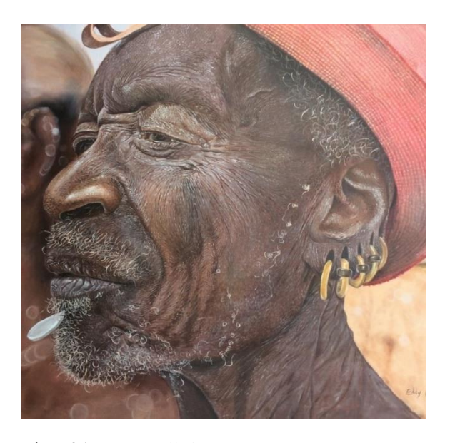
Plate 21. 'After all these years (2017)

hundreds of stitched beads. She also adorns a traditional hairstyle on an otherwise clean-shaven head as well as showing an element of ear lobe piercing. One of the purposes of portraiture is visual cultural propagation where certain aspects of culture that pertain to the face and upper torso are displayed. In related portraits, these could be such as the adornment of traditional jewellery, facial, neck and chest decorations, ritual scarification, ear piercing, lip extension, labrum piercing and many others. The artist paints the face in realistic detail, depicting the woman smiling warily in what is referred to as a 'tight smile'. The gaze in her eyes is studious yet a little wary. Although such portraits are culture-specific, focusing more on depicting aspects of culture, the face really never strays far away from some form of innate individual suggestion of situational narrative; what could she be wary of? Is her life as gentle as the look on her face or is it all a great façade?