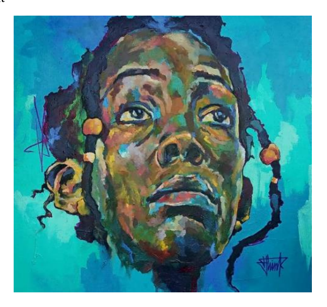
Plate 14. 'Are we still friends'

'Thou shall not fear' (Plate 13) is an impressionist inspired portrait characterized by short, bold brushstrokes and an array of unusual colours and colour tones that are applied directly and spontaneously rather than pre-mixed on the palette. The artist is only concerned with the level of detail enough to capture the subject's essence and render the desired expression on the face. The artist also uses the effect of natural light to capture its transient