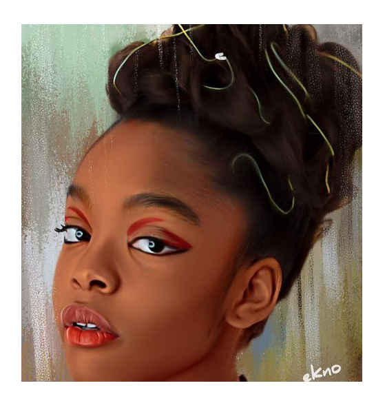
Plate 10. 'Marsai Martin' (2019)

In Plate 9 , the artist depicts the portrait of a young girl placed in a gestural pose that is both charming and engaging. The gestural pose itself, including her hand holding onto the wall edge, enhances the girl's almost playful physical presence as if she is emerging from behind the wall. The artist studies the smooth, youthful skin and facial demeanour that depicts a gentle hidden smile that is present but not obviously rendered. The ability to suggest an underlying smile that is mildly present but not necessarily breaking through across the lips is a unique artistic attribute. The artist also studies the eyes that possess an engaging gentle gaze. The portrait is enhanced by the colourful attire and bold hairstyle. This portrait demonstrates the artist's