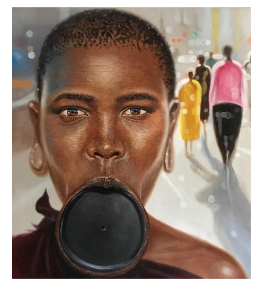
Plate 22. 'Stand out'

The portrait 'After all these years' (Plate 21) depicts a Turkana elder and is an outstanding example of the essence and power of portraiture. This portrait serves both a visual cultural purpose as well as