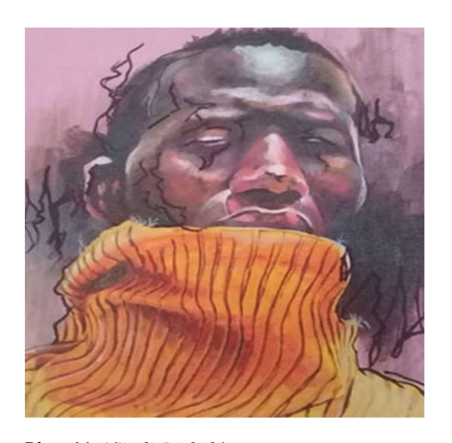
Plate 11. 'Sijali Juakali'

since the referent source is not available. It can be determined, however, going by the precision of execution, that this objective was attained. Though such portraits still underscore the essence of youthfulness, particularly the manifestation of innocence and perhaps naivety, the main intention of the artist is to attain a high degree of likeness of the subject and in this case, the specific embellishments that enhance that likeness.