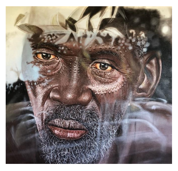
Plate 12. 'Through the lens 2' (2021)

Plate 11 is a portrait that depicts a definition of a person in distress. The eyes are closed in a manner that suggests some kind of personal turmoil and the subject wears a pull-neck that is stretched right up to cover the lower lip. This results in a gestural pose that is expressive of distress. The artist uses tones to describe the structure of the face including prominent cheekbones and a wide face. He also uses the effect of light falling upon parts of the face that helps to enhance the facial form. Portraits can be used to express certain human emotions including the more obvious ones such as joy, laughter, anger and disdain; but as this portrait demonstrates, also those that are less obviously apparent such as elements of distress like inner fear, worry,