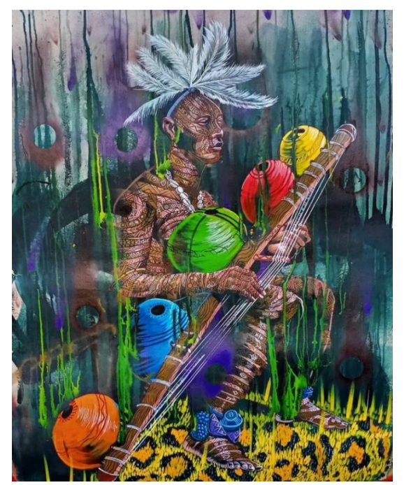
Plate 5. ' Thu'm' Artist: 'Thufu B'

Mixed media on paper: 140 x 112 cm