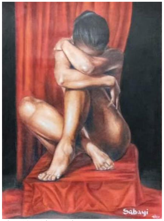
Plate 19. 'A lost soul' (2020) Artist: Moses Sabayi