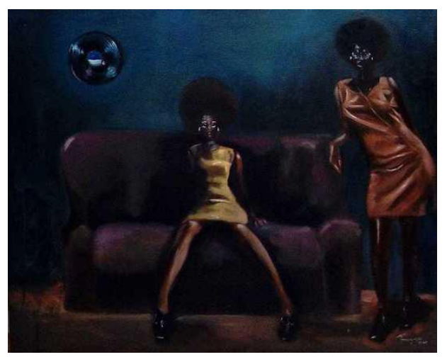
Plate 24. 'The Golden girls' Artist: Jimmy Kitheka Oils on canvas: 110 x 100 cm

In 'The golden girls' (Plate 24), the artist depicts the 'golden girls' and the audience immediately