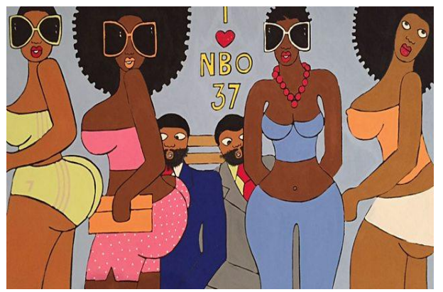
Plate 18. 'I love Nairobi 37.'

In the paintings, the artist depicts the women in their element in Nairobi's nightlife. In '11 Pro max'