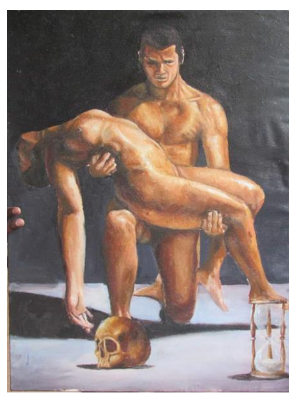
Plate 20. 'Romantic death' (2018)

In 'A lost soul' (Plate 19), the artists paints an image of desperation, a depiction of personal upheaval that is painful and lonely and which touches on mental health. This kind of painting is usually an 'expression' that is a response to a known situation that is profound and touching. The forlorn gestural pose of the naked female form and particularly the action of burying her face in her folded arms is not only a physical testimony of her personal upheaval but is symbolic of the fragility of the human mental equilibrium that is often taken for granted. This culminates in the kind of broken mental state that leads to the dark abyss of despair, and hence the title 'A lost soul'. The artist uses the effect of illuminative light, shadows and a very dark background to focus upon the nude female form. This chiaroscuro effect, normally used on wellexecuted realistic forms, has been used by artists across time, notably in the work of Rembrandt, Caravaggio and Goya, to focus attention upon a pertinent part of the painting in order to draw meaning. The female form itself is well modelled with accurate proportions and the use of a variety of tones and shadows upon the body structure in order