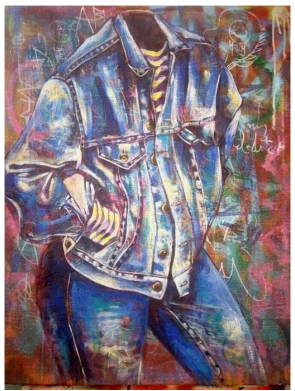
Plate 10. 'Blue on Blue' 2019

'Stolen sweater' (Plate 9) is an actual story of a beloved beautiful multi-coloured sweater that went missing from a wardrobe. The distraught artist narrates this episode in a painting that shows the probable culprit adorning the multi-coloured sweater. The girl, perceived as young and innocent, covers her face leaving only her eyes, which is symbolic of guilt; she must not expose her face lest she is identified as the thief. The artist studies the colours of the sweater in almost nostalgic detail as if coming to terms with its loss. The thief, however, remains unidentified; it could be a relative, friend, colleague or just an acquaintance. The painting, by extension, underscores the 'enigma of friendship'; that those close to somebody (symbolised by the notion of access to the wardrobe) would be the same ones who steal something uniquely valuable and personal, in complete disregard of the tenets of friendship. This implies, though, that the notion of friendship is not always based on sincerity. The gist of the message is that those who bear the capability to harm you are those within your closest orbit.