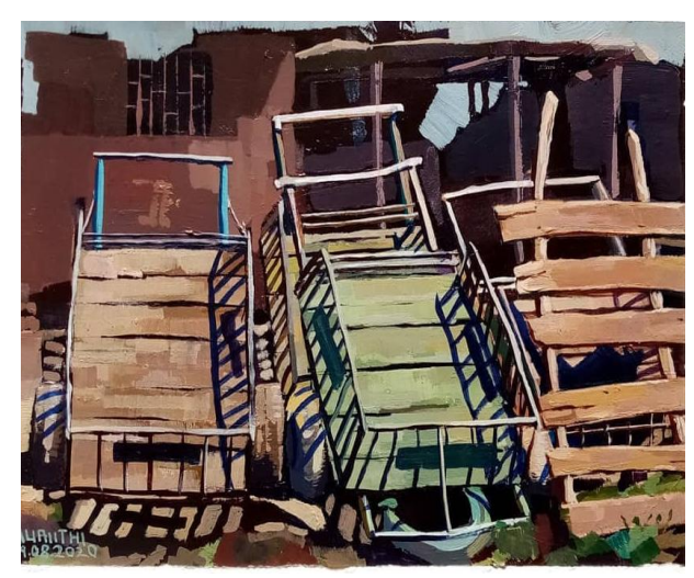
Plate 33. ' Mikokoo ' Artist: Samuel Mureithi Acrylics on paper: 39 x 28 cm