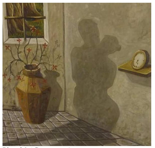
Plate 26. 'Guest room' Artist: Andrew Otieno Oils on canvas – 100 x 120 cm

'Guest room' (Plate 26) is a simple but very intriguing painting. It depicts the 'goings-on' in the guest room, of which the artist uses suggestive shadows that tell the story of the happenings. This covert approach of portraying subject matter is often very potent since the artist suggests an anticipated or unfolding situation without involving actually painted forms, leaving the audience to draw their own conclusions about the probable outcome. The shadows in this case 'tell' the story of two 'lovers' entering a room, already locked in a romantic embrace, but the artist does not show their actual