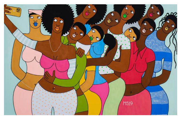
Plate 17. '11 Pro max' (2019)