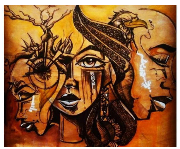
Plate 31. 'Sivana' (2017) Artist: Chelagat Cherwon Acrylics and charcoal: