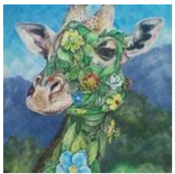
Plate 25. ' untitled . Artist: Ron Lukes