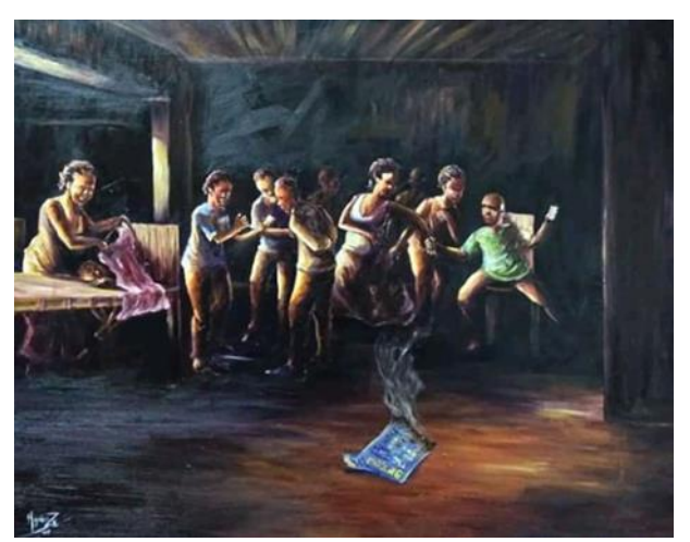
Plate 11. 'Betting Imechomeka' (2020)