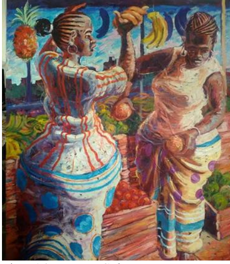
Plate 14. ' Mama Soko' (2014) Artist: Patrick Mukabi

In 'At the market' (Plate 13) and 'Mama Soko' (Plate 14), the artists depict typical scenes at the fruit market on a bright sunny day. It shows the boisterous African women going about their day's business. The artist depicts the women with their full rounded bodies, pronounced buttocks and full breasts, a description perhaps of the physical features that underscore their femininity. He also features their famous bright coloured and patterned waist wrappers known locally as 'Kangas'. In the background, he features their small businesses fully stocked with an assortment of seasonal fruits, which are a pointer to their acumen and dedication. The artist includes many gestural poses which underscore the spontaneity with which the women conduct their work as well as their mannerisms, but he ensures that the women always take centre stage in each painting. The paintings are themselves not detailed but are well executed with just enough visual information necessary to fit his purpose. But it is, perhaps, the artist's ability to create the feeling or aura of the unfolding scene that is fascinating. These African women are dedicated to their work. They wake up very early each morning to purchase their supplies from the wholesale market in order to make them available to their retail customers every day of the week; that is how they eke out their living which means they play an integral part in generating