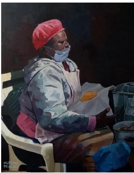
Plate 7. 'Mama Ngwaci' (seller of sweet potatoes)