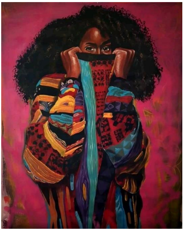
Plate 9. 'Stolen Sweater' 2021