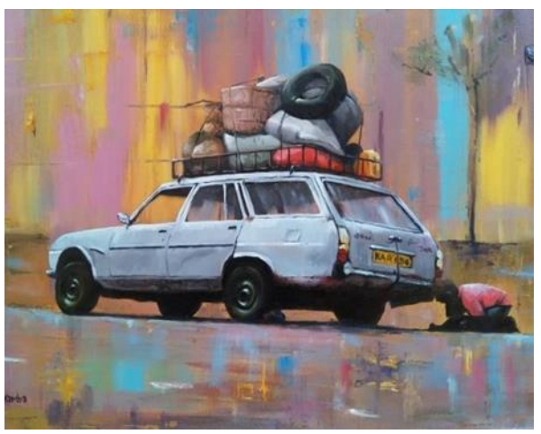
Plate 30. 'What is this again?' (2020)

Some paintings depict what is often referred to as the dilemma of life. Often the actions of human beings render the outcome of their work futile and their actions may, at times, appear irrational and counter-productive. Plate 29 depicts this dilemma, which dictates that on the one hand, goods need to be transported in bulk because it makes economic sense to do so; but on the other hand, the goods cannot reach their destination because the vehicle is too overloaded and ill-maintained to make the journey. This culminates in a futile outcome. The irrational part of it is that the people transporting the goods somehow do not comprehend the correlation between the weight of the goods and the mobility of the vehicle. They cannot grasp, or choose to ignore the glaring natural logic that overloading a battered ramshackle of a vehicle to the extent that it cannot move, is not only futile but borders on stupidity. The artist is dumbfounded by this tendency and depicts this in a realistic style that combines an aspect of caricature. While such paintings may appear bizarre or even surreal in a normal worldly sense where order exists, when they are placed in the context of their occurrence, then it becomes somewhat