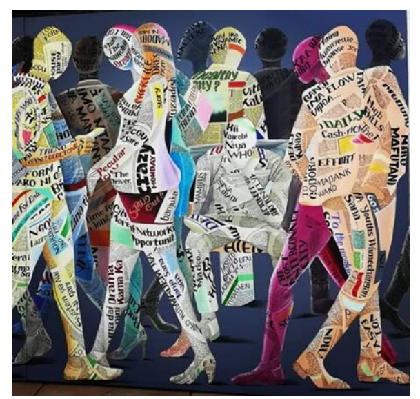
Plate 22. 'The daily stories'

'Caught in the moment' (Plate 21) was inspired by the spontaneity of the pose where the artist sought to capture the moment as the man flipped through the pages of the magazine. The artist was also captivated by the moments of intense concentration on the face of the man as he flipped through the magazine. She, therefore, sought to depict this in the gestural pose and demeanour of the man, as well as the intensity of concentration shown on his face. There are only minimal facial details as compared to a regular face portrait and perhaps due to the angle and distance of study. The facial character, including the sunglasses, is, however, very well defined, suggesting a likeness that is relatable to the identity of the person. The artist uses the effect of illumination to reflect a little blue background colour upon the left side of the face and parts of the shirt. The style itself shows the use of bold brushstrokes and flashes of bright background colours. The use of dark tones contrasts sharply with the white shirt and cap making the individual's image stand out as the centre of interest. These kinds of half-body portraiture are not often