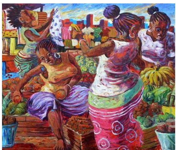
Plate 13. 'At the market' (2010) Artist: Patrick Mukabi