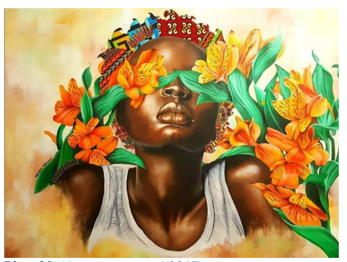
Plate 28. 'Innocent vision' (2017)

In 'Warriors' (Plate 27), the painting depicts the elegance of two women warriors, placed in the fashionable world of modernity, complete with jewellery and other adornments. The idea of African women warriors is not far-fetched. There were traditional African communities that had women warriors in the real sense of the word, and there were some few African Kingdoms that were led by glamorous and extremely powerful warrior Queens at some point in their history. Some of the most celebrated were the Amazon female military regiment of the Kingdom of Dahomey; Queen Amanirenas of the Kingdom of Kush in present-day Sudan; Queen Amina of the Zazzau Kingdom of Nigeria and Nzinga Mbandi of the Ndongo and Matamba Kingdoms of Angola, among others. The painting, well-executed with intricate details of regalia, seems in its rendition as a romanticisation of the term 'warrior' in order to celebrate the role