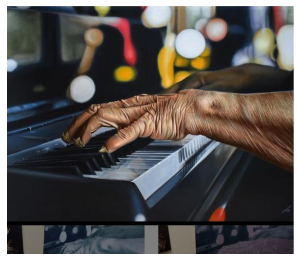
Plate 1. ' Hands on Piano ' (2019) Artist: Clavers Odhiambo Oils on canvas: 140 x 100 cm