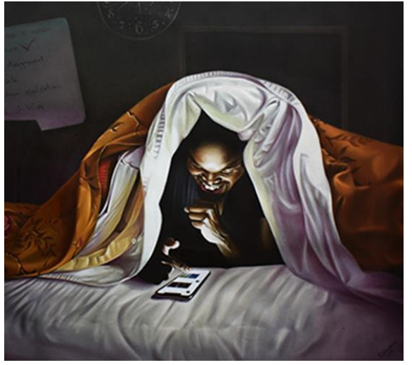
Plate 2. 'First things first (2019) Artist: Clavers Odhiambo Oils on canvas: 120 x 100 cm

'Hands on Piano' (Plate 1) is a hyperrealistic piece showing the study of the arm, hand and fingers as they work the piano keys. It focuses on the folds on the arm and fingers as the fingers stretch into position to make the music. Hyperrealism is a style that seeks to supersede photographic effects and refines these effects into a new form of flowless, superfine art that shows details better than its referent photograph. The fine textural effects on the arm suggest that the astute musician is an elderly individual. Started in the mid-1970s and relying on digital imagery and the high-resolution pictures produced by digital cameras, hyperrealists aimed at taking their art a notch higher than photorealists to create a work so fine with details that are not fathomable in reality, therefore, creating an illusion of new reality. It is unlikely that even a photograph would perhaps present details of folds as they are presented in this painting. Since the details of the folds are so fine and intriguing, they create a new reality through which we may wish to see the hand actually look-like. The rest of the painting is also very finely done with a photographic variation of tones and suggestion of blurred background colours.