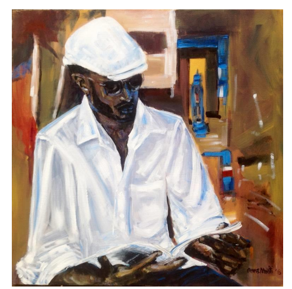
Plate 21. 'Caught in the moment' (2018)

occurrences, the audience is neither emotional partakers nor 'experiencers' of the tragedy.