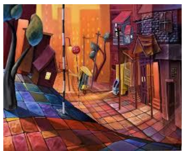
Plate 23. 'Empty street' (2018) Artist: Michael Musyoka Acrylics on canvas: 150 x 199 cm

In 'Empty street' (Plate 23), the surrealistic painting depicts an empty street that also shows a rather bizarre concept of timelessness which is characteristic of surrealism. The looming shadows and bright light falling in some places make it neither dawn nor dusk, just an eerie timelessness upon an empty street in which there is no life. The artist uses a suggestion of false perspective with a lone lighted house on the left side just about to tip over. He applies an array of beautiful tones of colours such as yellows, oranges, purples, blues and arranges them in a manner that creates an intriguing sense of false depth. He also uses the illuminative effect to shine light upon some parts of the painting while also using dark tones on other parts to form contrasts that create an aura of mystery. The static feeling, lack of human life or any visible living thing creates a feeling of eerie silence and gloom. Paintings that depict such unusual or surreal circumstances usually emanate from subconscious imageries that manifest in dreamlike dispensations.