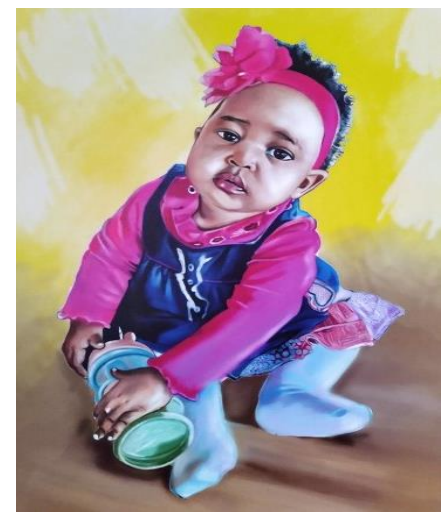
Plate 34. 'Young angel' Artist: Eric Wambugu

Young angel (Plate 34) depicts a young African child wearing colourful clothes with beautiful tones and folds that underscore the playful gestural pose. Paintings of children have the ability to suggest childlike innocence, a visual attribute that is more believable when seen in the context of a child's accurately portrayed facial features than is possible in paintings that feature adult faces. The painting accurately shows the image of the child's pertinent features such as the wide eyes, small nose, little lips