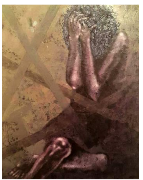
Plate 16. 'Crossroads III' (2017) Artist: Naitiemu Nyanjom Mixed media on canvas: 80 x 100 cm

'Outdoor scenery' (Plate 15) is a lively study of a rural African setting. The artist, who says he is inspired by the style of Vincent Van Gogh, uses bold brushstrokes and finely executed perspective to capture the winding dirt road, the vegetation and trees that make the composition. He also uses a combination of white, blues and greys to show the background that shows a distant clear blue sky in the midst of gathering storm clouds. The artist also illuminates parts of the painting with natural midday light suggested by shadows falling directly beneath the vegetation. The painting captures the pertinent details of the scenery with bold yet precise brushstrokes that make the painting life-like, pleasant and enjoyable.