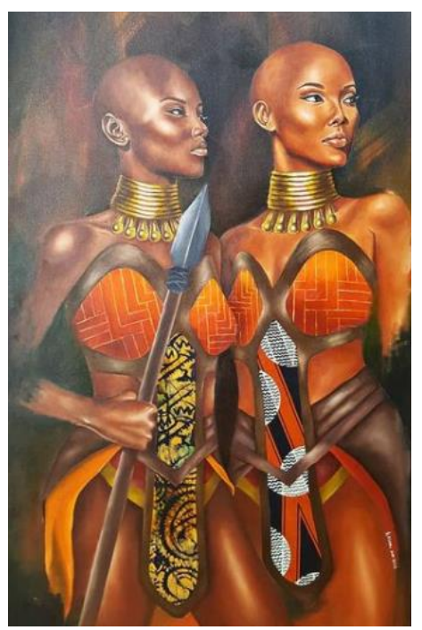
Plate 27. 'Warriors' (2018)