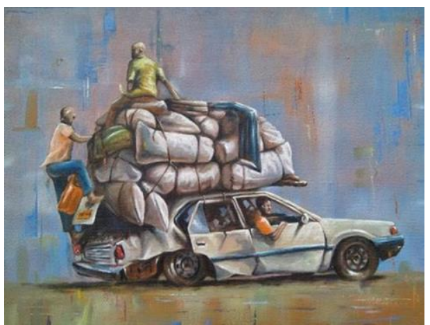
Plate 29. 'Gone are the days' Artist: Zephania Lukamba Oils on canvas: 45 cm x 35 cm

Some paintings depict what is often referred to as the dilemma of life. Often the actions of human beings render the outcome of their work futile and their actions may, at times, appear irrational and counter-productive. Plate 29 depicts this dilemma, which dictates that on the one hand, goods need to be transported in bulk because it makes economic sense to do so; but on the other hand, the goods cannot reach their destination because the vehicle is too overloaded and ill-maintained to make the journey. This culminates in a futile outcome. The irrational part of it is that the people transporting the goods somehow do not comprehend the correlation between the weight of the goods and the mobility of the vehicle. They cannot grasp, or choose to ignore the glaring natural logic that overloading a battered ramshackle of a vehicle to the extent that it cannot move, is not only futile but borders on stupidity. The artist is dumbfounded by this tendency and depicts this in a realistic style that combines an aspect of caricature. While such paintings may appear bizarre or even surreal in a normal worldly sense where order exists, when they are placed in the context of their occurrence, then it becomes somewhat